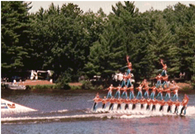
State Water Ski tournament at Lake Wazeecha

Suggestion: Save this handbook in phonebook for reference