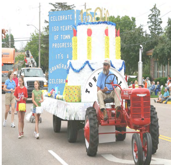
Town's 150 th birthday float